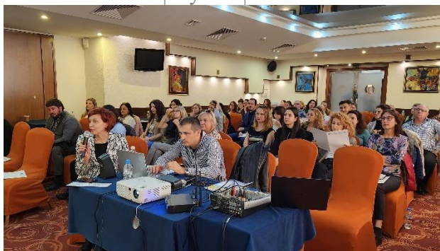
PhV Regulatory update, Part 1 | Module 1, DRA – update, TC | October 07, 2022 | Virtual event