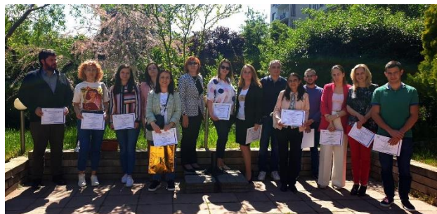
Foundation Skills in Drug Regulatory Affairs, Training course, 12-13 of May, 2022