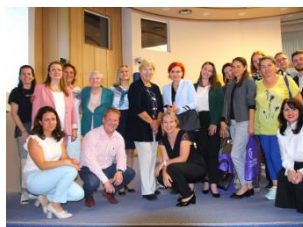
Annual Congress of BADI 2024| June 06, 2024 BG & EU Speakers, Representatives of BG & EU agencies