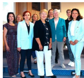
Annual Congress of BADI 2024| June 06, 2024 | The team of speakers, moderators & guests